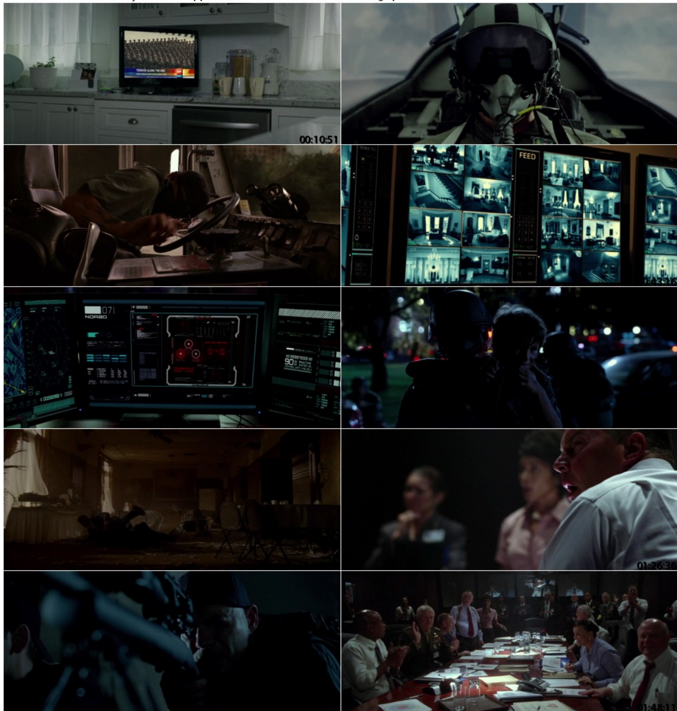
The Dreamers (2003) UNCUT BluRay 720p DTS X264-CHD

File: Olympus.Has.Fallen.2013.720p.BluRay.x264.Dual.Audio.English.Hindi.Esub-GOPISAH1.mkv Size: 988925639 bytes (943.11 MiB), duration: 01:59:09, avg.bitrate: 1107 kb/s Audio: aac, 48000 Hz, stereo (hin) Audio: aac, 48000 Hz, stereo (eng) Video: h264, yuv420p, 1280x538, 24.00 fps(r) (eng) Subtitles: eng Purchase Premium From My Links To Support Me & Get Unlimited Downloading Speed